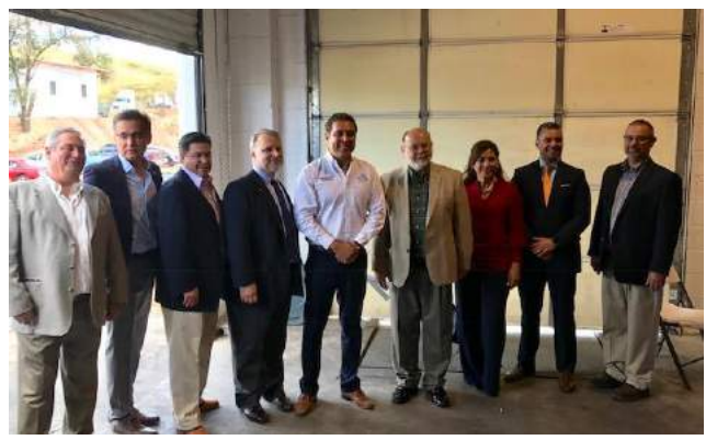
Arizona and Sonora leadership at the ADOT Safety Training Certification in Nogales, Sonora