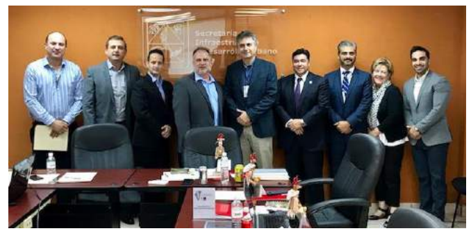
Transportation and Infrastructure Committee meeting