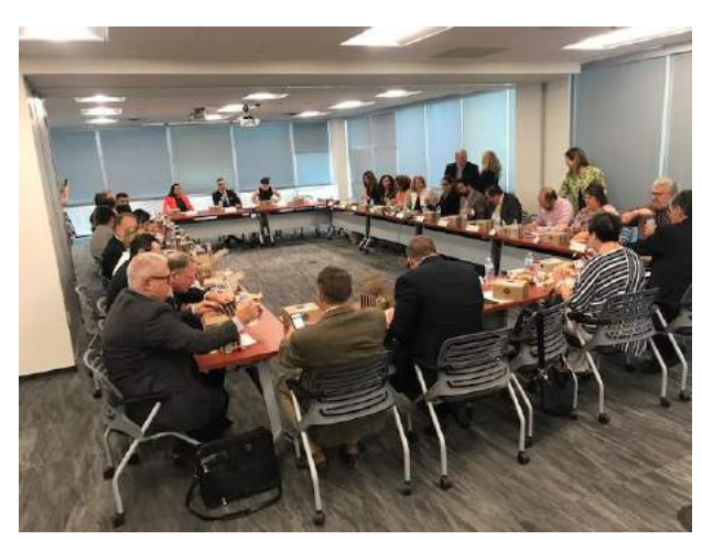
AMC Committee Chair Luncheon