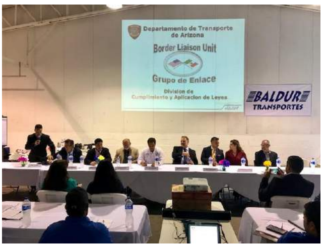
ADOT Safety Training Certification Program