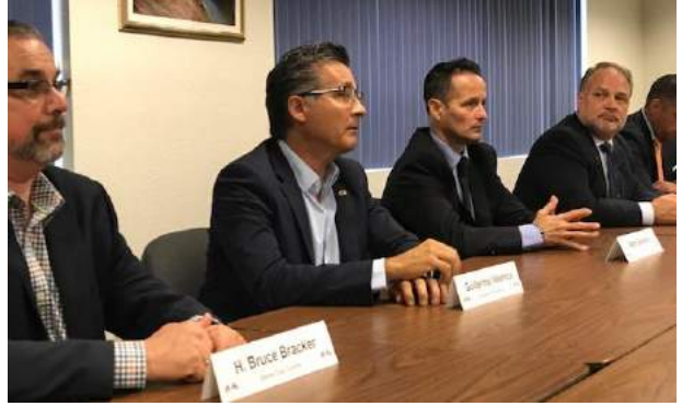
ADOT Press Conference on Safety Training Certification Program