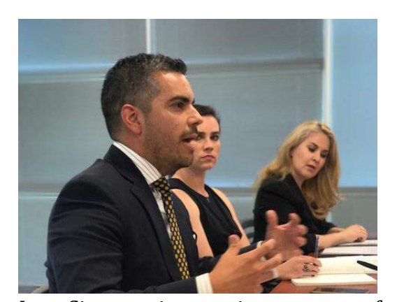
Juan Ciscomani conveying a message from Governor Ducey