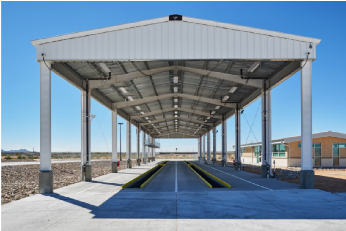
Federal Motor Carrier Safety Administration inspection canopy

GSA is partnering with the Federal Motor Carrier Safety Administration (FMCSA) to develop a program of projects at a number of Land Ports of Entry (LPOEs) so that FMCSA agents can safely and effectively inspect both commercial truck and bus traffic.