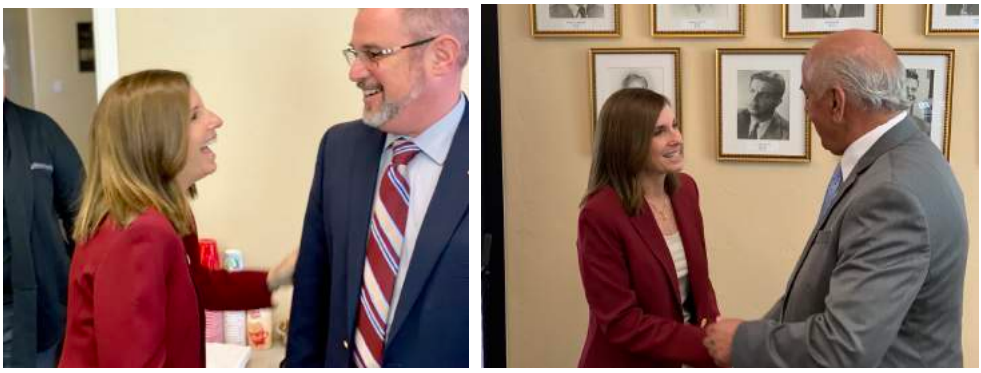
Senator McSally with Supervisor Bruce Bracker and Mayor Arturo Garino