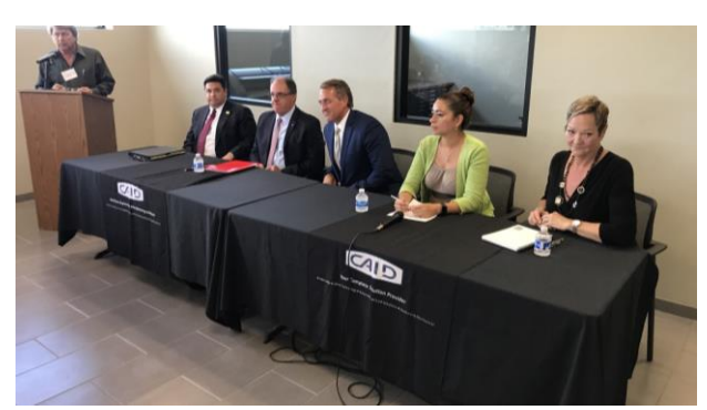
Panel during the NAFTA event