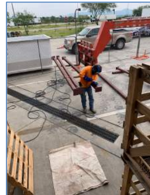
Construction of Cold Rooms at Mariposa Port of Entry