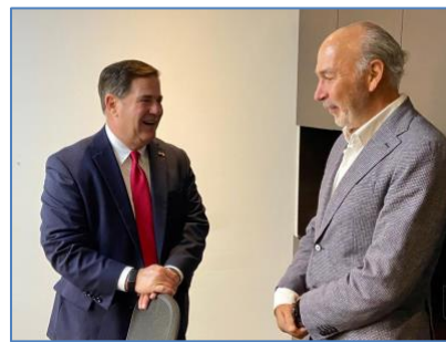
Governor Meets with Grupo Bal