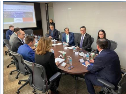
Governor meets with leadership of INDEX, CANIETI and FEMIA