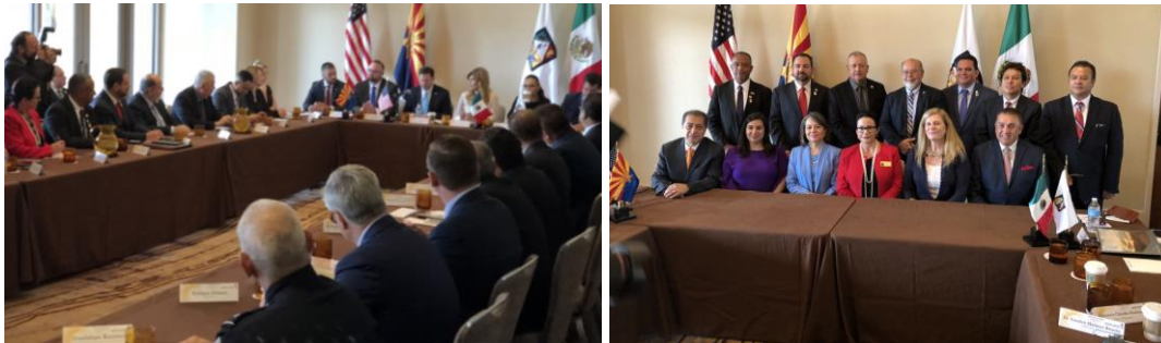
Private meetings during AMC Summit, Border Mayors with US and Mexican Consuls