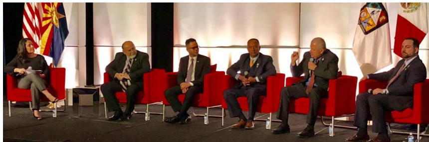
Border Mayors Panel Discussion on business opportunities