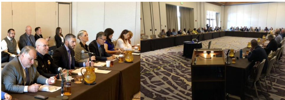
Participants during Border Congressional Briefing