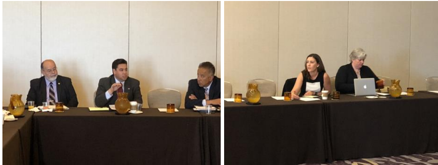
Nogales representatives during Congressional Border Briefing