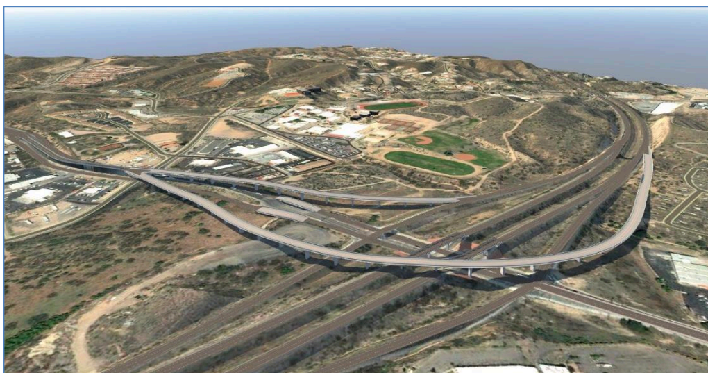
Schematic of the SR-189 Full Build Out