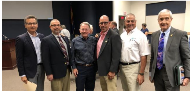
Nogales representatives presenting during Transportation Study Session