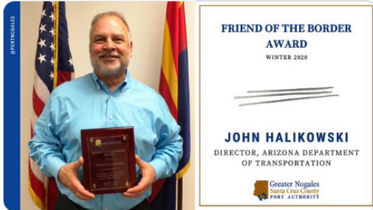
Santa Cruz County AZ and 8 others