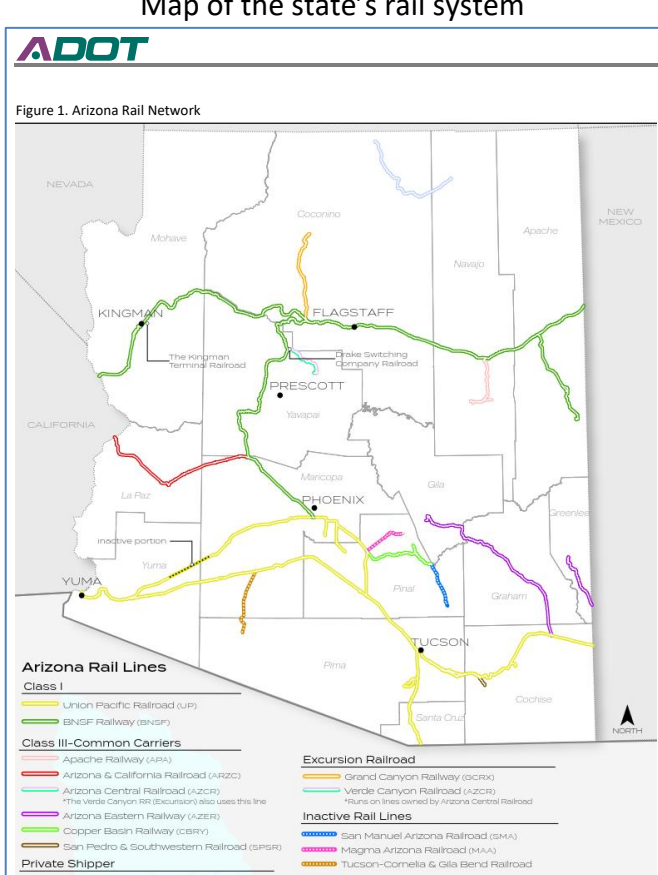
Map of the state's rail system