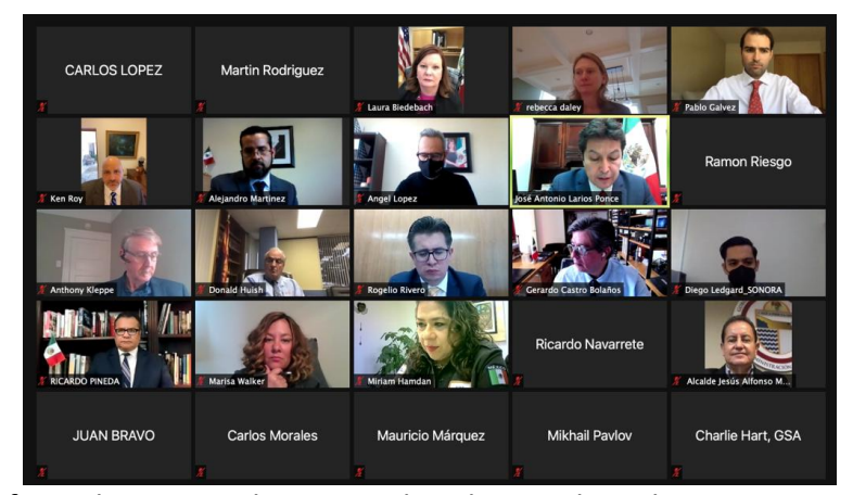
Images from the Regional Binational Bridges and Border Crossings Meeting