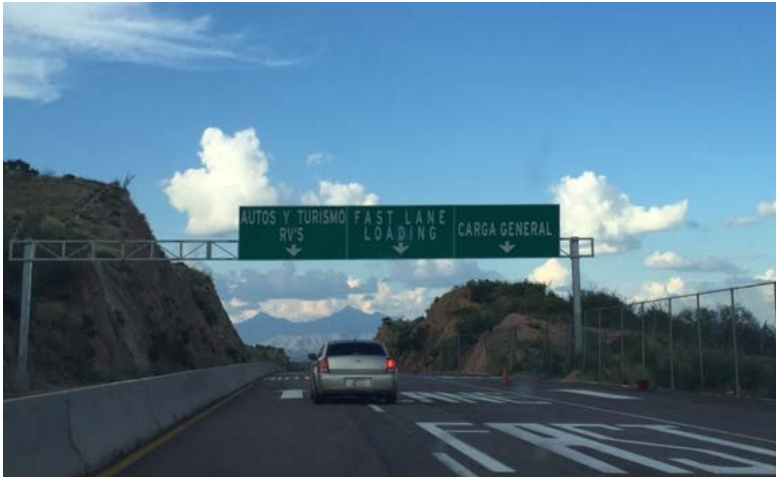
Signage for FAST Lanes has not been changed