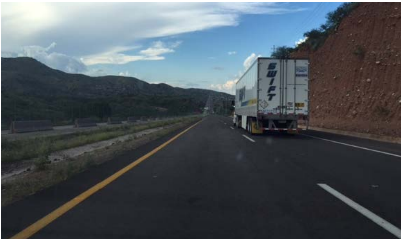
Paving of the roadway has been completed