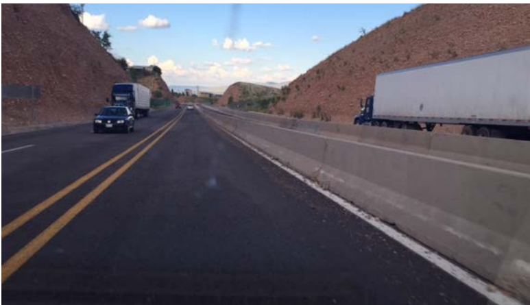
Concrete barriers have been changed