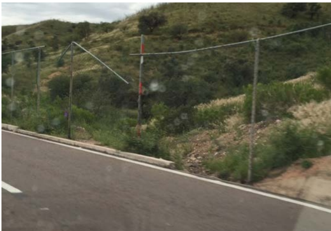
Fencing is still in poor condition