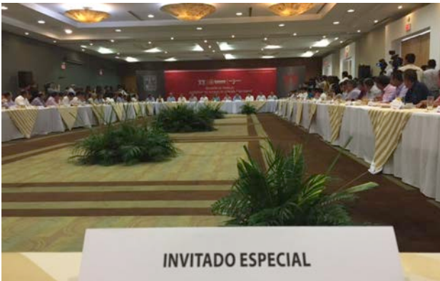
Governor Pavlovich hosts breakfast with all 72 Municipal Presidents-Elect (all were present)