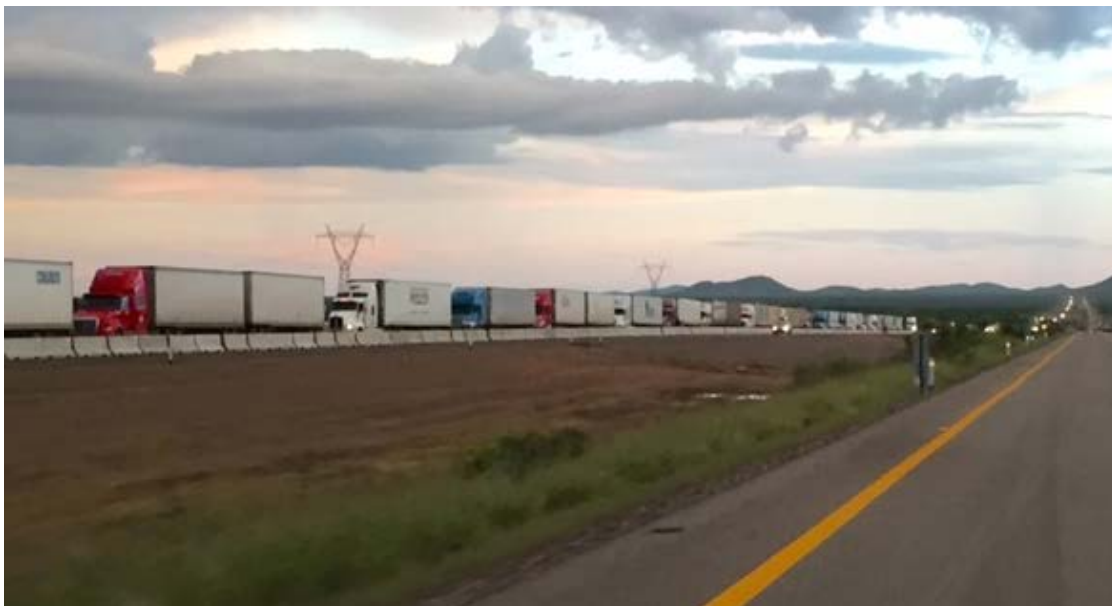
Photos of Querobabi on Friday, September 12, 2015 at 6:20 PM. Line estimated at more than 5 KM of trucks.