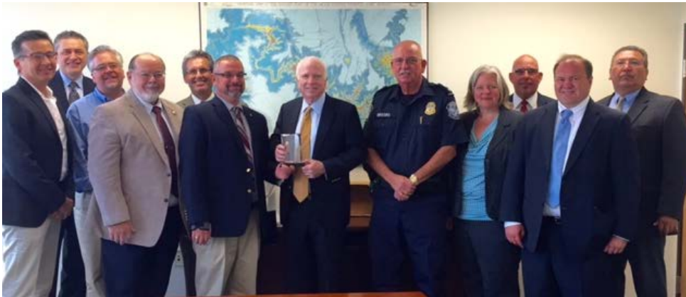
Photograph with Senator McCain as he receives the plaque from the GNSCCPA